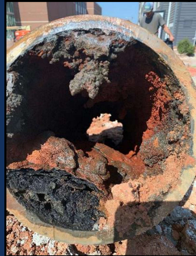
Hester St. Abandoned Water Line 2020

To develop a strong sense of place that recognizes the interconnectedness of people, buildings and public systems (such as transportation, utilities and parks) that best serve the needs of the public.