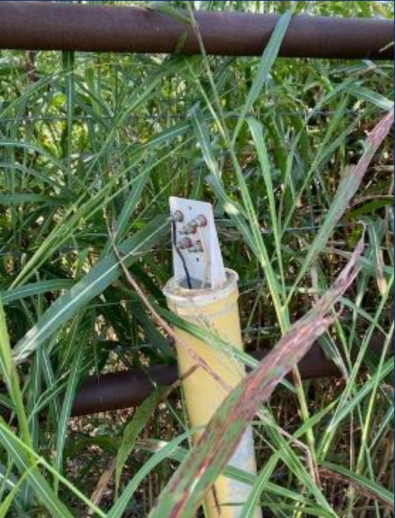
CATHODIC PROTECTION TEST STATION