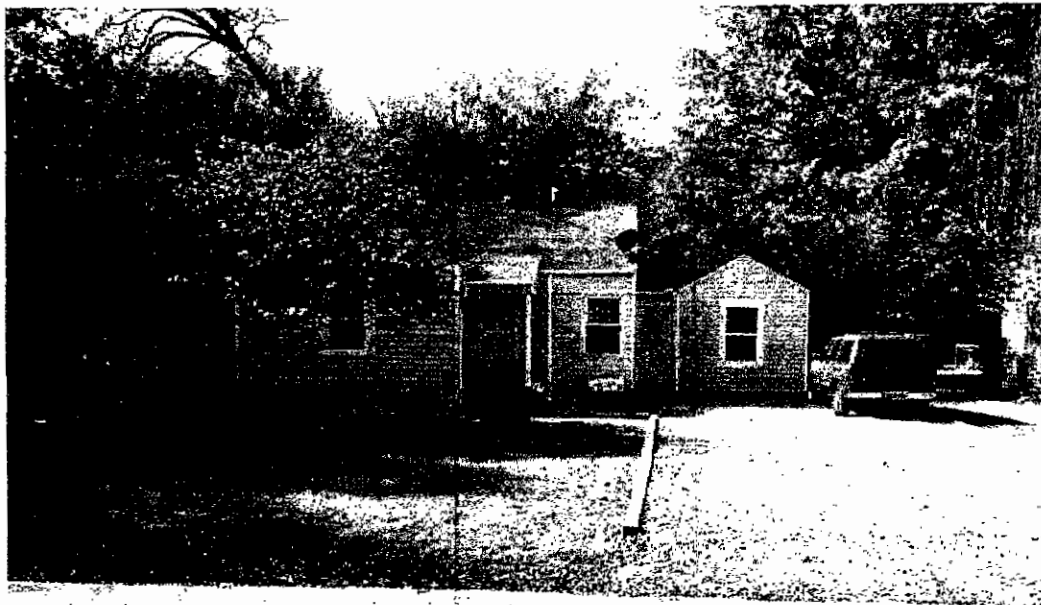
Photo Two Caption Front View